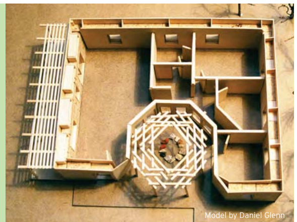
Model by Daniel Glenn

The Nageezi House was designed as a Leadership in Energy and Environmental Design (LEED) for Homes project during the pilot phase of the program, although it was never certified as a LEED Homes project. In the building of this affordable and sustainable demonstration home, several of the green strategies were intended to be replicable and low-cost approaches, including building orientation, passive cooling/ventilation, and passive solar heating. Following construction, the home was monitored for a full year to evaluate its performance with embedded temperature sensors in the walls and on the interior and exterior of the home, which demonstrated that overall energy use in the home is reduced 50 percent from a conventional home. The site is not irrigated; a gravelled surface surrounds the home.