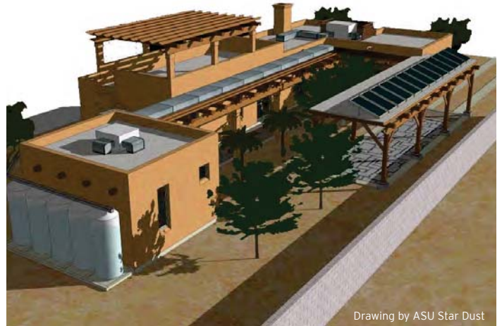
Drawing by ASU Star Dust

This home was designed as a prototype for the town of Guadalupe, its climate, and its culture. The design was developed in a "kit-of-parts" workshop process with community members and the homeowners, the Bejarano family. Several key elements came out of this process, including a courtyard-style design for cross-ventilation; and the creation of a large shaded outdoor space for large family gatherings; the separation of the master bedroom for the elder homeowners from the bedrooms for their adult children; the inclusion of a "casita," a small, separate guest room for visiting family members or adult children; the capacity to expand the home upward, to add additional rooms or an apartment for the expanding family; the incorporation of a carport, both for cars and as a outdoor "ramada," a shade structure to use for large family gatherings; and the centrality of the kitchen opening directly to the living/dining areas.